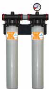
2-Stage Model: FS-HF2-2M