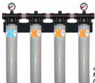
4-Stage Model: FS-HF4-D3M