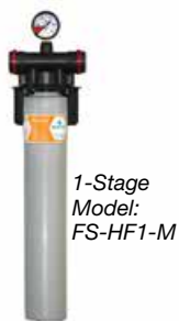
1-Stage Model: FS-HF1-M