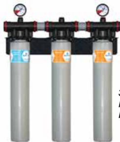
3-Stage Model: FS-HF3-D2M