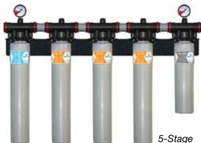
5-Stage Model: FS-HF5-D3ML