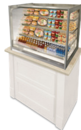
Model ITRSS4834 Counter not provided