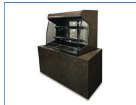
Model RSSM Drop In Option Contact Factory for more information.