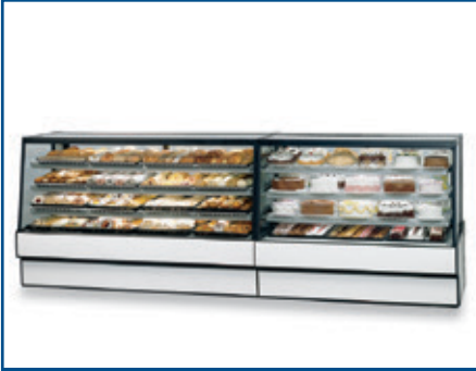
Model SGD7748 / Model SGR5948