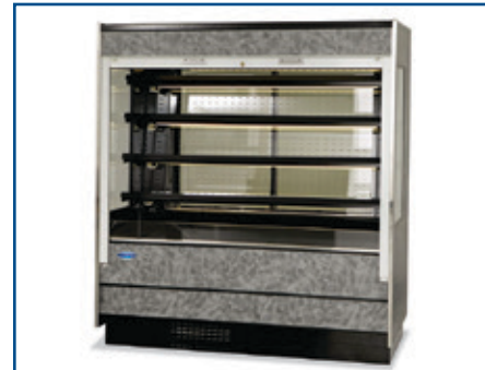
Model RSSM678SC with security roll-up cover requires squared ends. Shown with optional rear sliding doors.