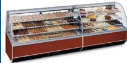
Model SNR59SC / SNR48SC