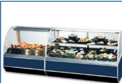
Model SN4HD/ Model SN6CD