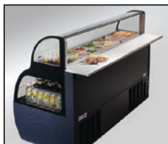
Model SSRSP5952 LED lighting lower section only