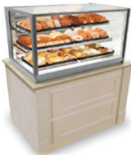
Model ITD4826 Counter not provided