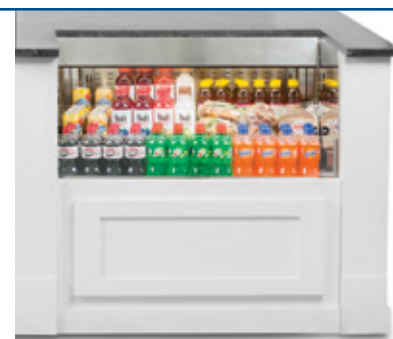
Model SSRVS Squared End Under Counter Option