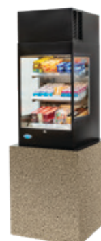
TSSM2454 Specialty Merchandiser See page 14 for more information.