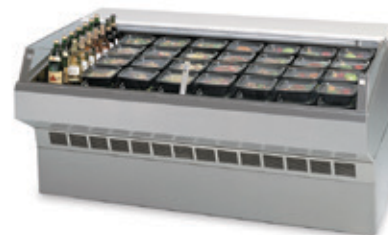
Model SQ8CDSS (Shown with panel base)