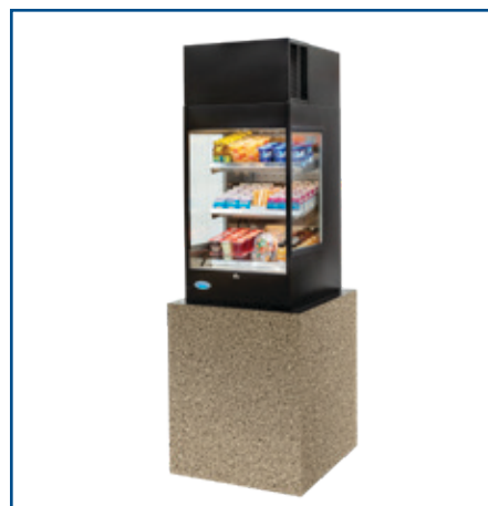
TSSM2454 Specialty Merchandiser Contact Factory for more information.