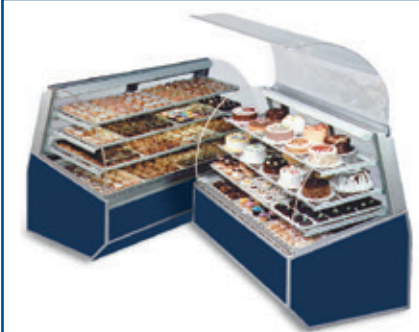
Model SN77 Lift-up front glass