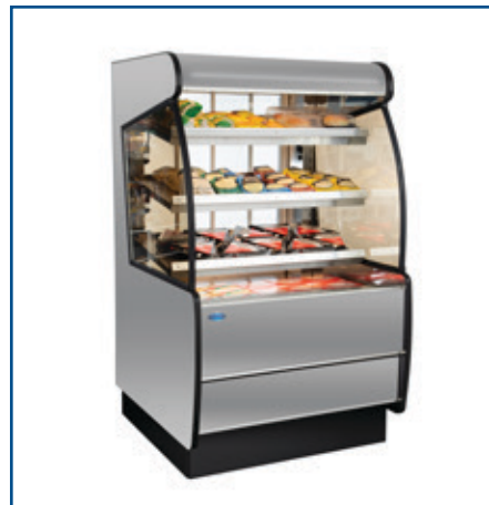
HSSM Heated Merchandiser