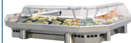
*Shown with optional closed pedestal base