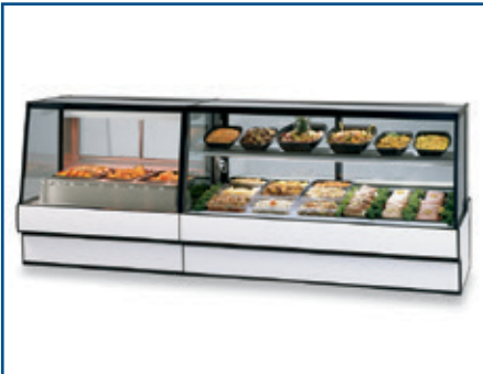
Model SG5048HD / Model SGR7748CD