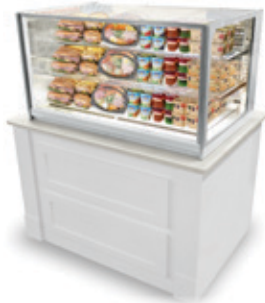
Model ITD4834-B18 Counter not provided