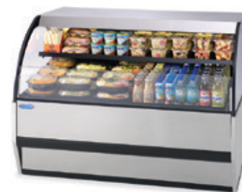
Model SSRVS5933 Shown with optional shelf