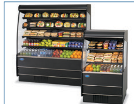
Model RSSM678SC / RSSM360SC