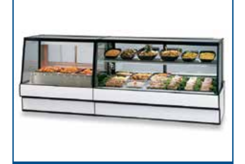
Model SG5048HD / Model SGR7748CD