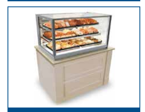
Model ITD4826 Counter not provided