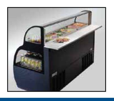
Model SSRSP-5952 LED lighting lower section only