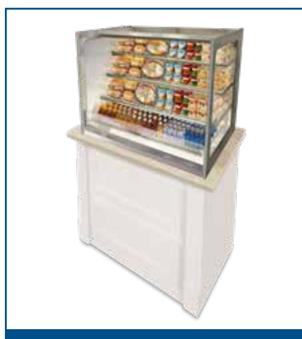
Model ITRSS4834 Counter not provided