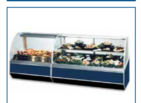
Model SN-4HD/ Model SN-6CD