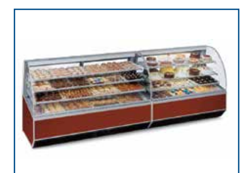
Model SNR-59SC / SNR-48SC