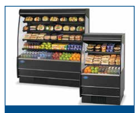
Model RSSM-678SC / RSSM-360SC