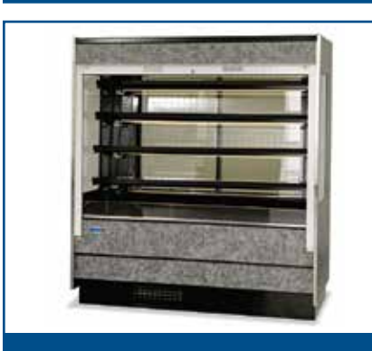
Model RSSM-678SC With security roll-up cover requires squared ends. Shown with optional rear sliding doors.