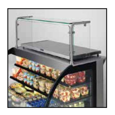
*Sneeze guard/bakery shelves cannot be installed in the field *Shown With Optional Sneeze Guard