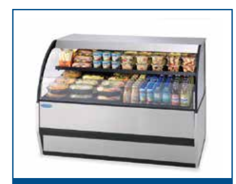
Model SSRVS-5933 Shown with optional shelf