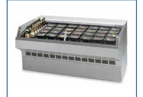
Model SQ-8CDSS (Shown with panel base)