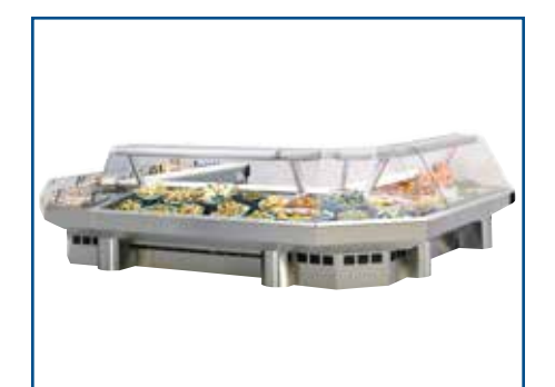
*Shown with optional closed pedestal base