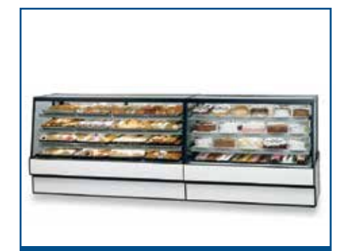
Model SGD7748 / Model SGR5948