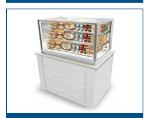
Model ITD4834-B18 Counter not provided