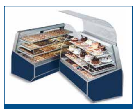
Model SN-77 Lift-up front glass