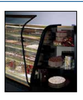
Hinged front glass tilts forward for easy cleaning.