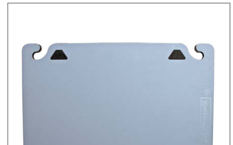
Double Food Safety Hooks for sanitary transport and storage