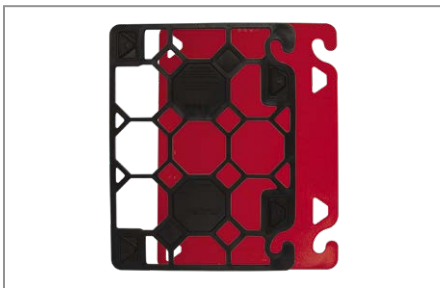
Frame and Board System to reduce costs and improve food safety