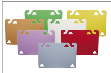
Color-Coded Cutting Board Refills to reduce cross-contamination