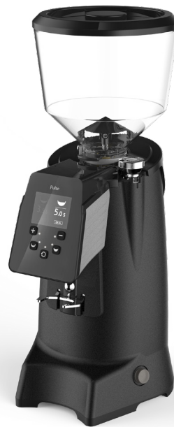
PULSE 65 & 75