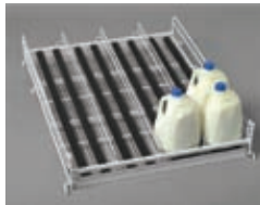
GFS w/"Grooved" Rollers