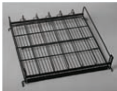
GFM (Gravity Flow Merchandiser)