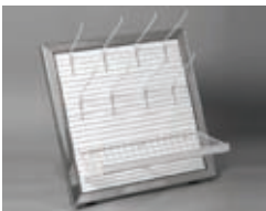
Half Door Deli View