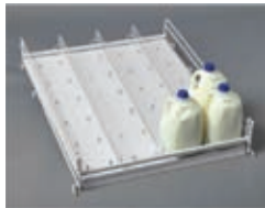
GFS (Gravity Flow Shelving)